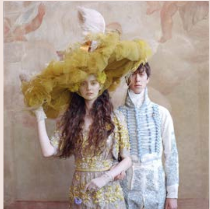
“Head Over Heels” for Vogue US August 2020