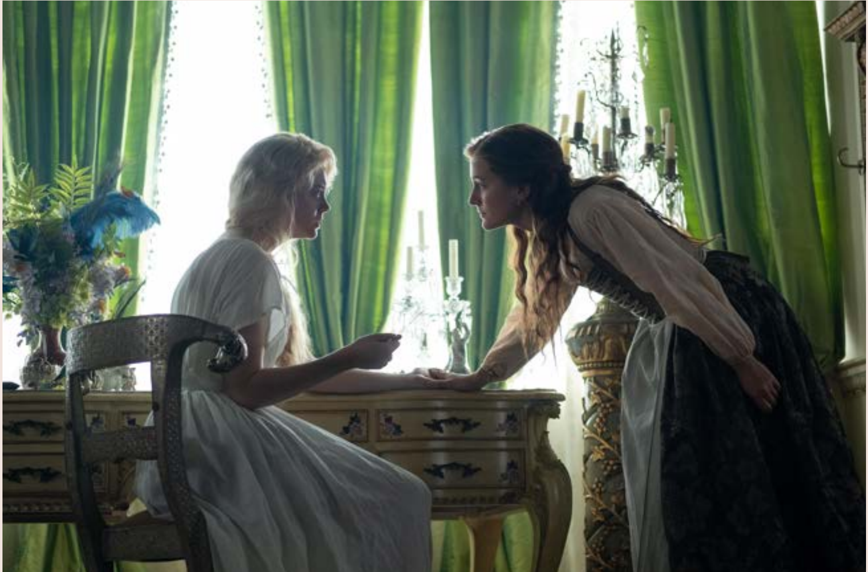
The Great, Hulu Productions