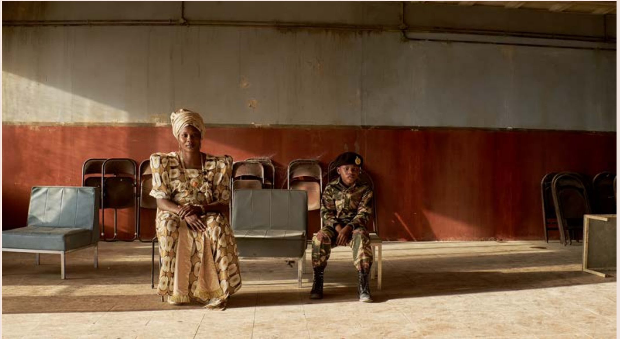
Entebbe, Working Title Films