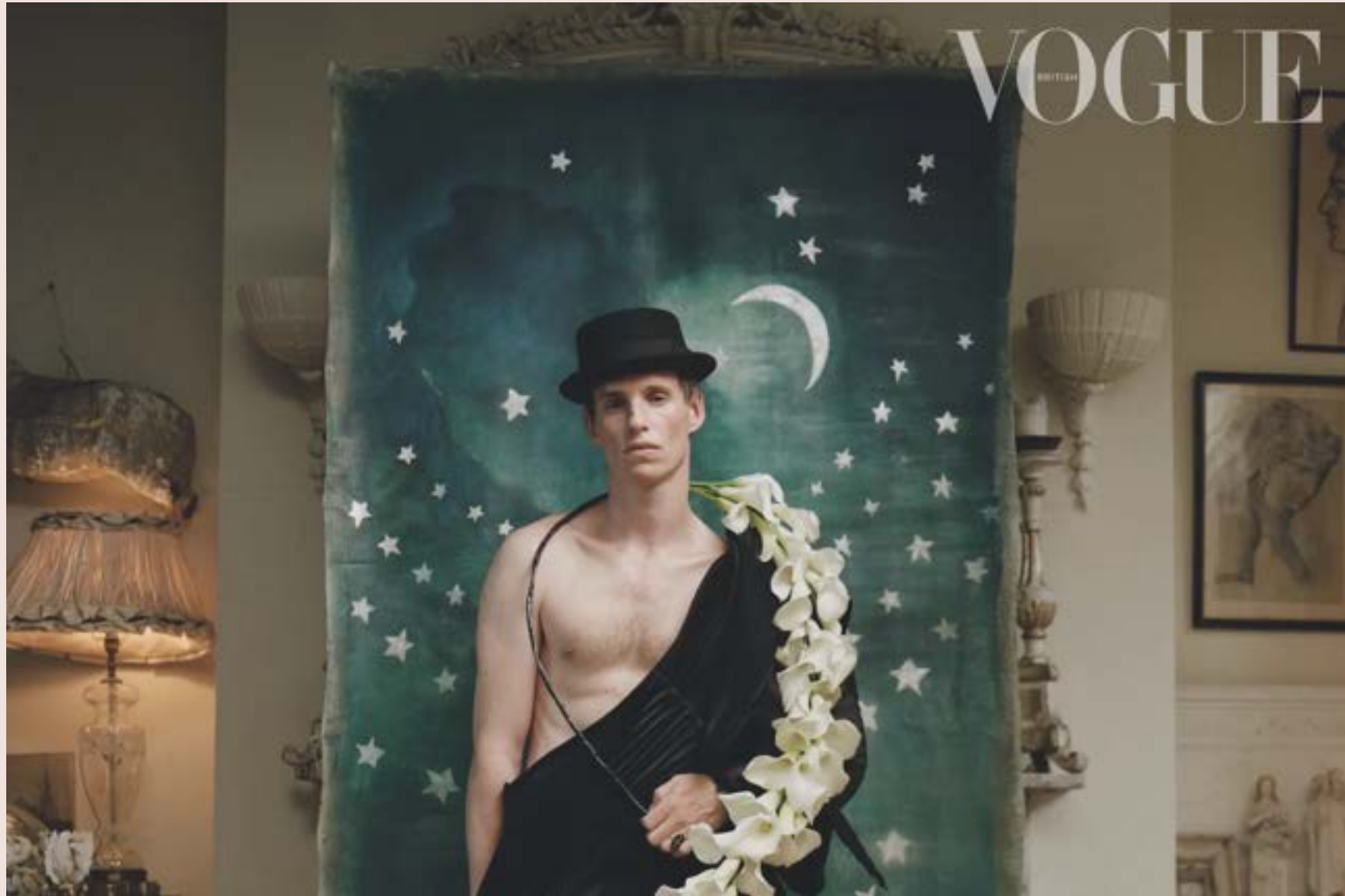
“A Party At The End Of The World” for British Vogue