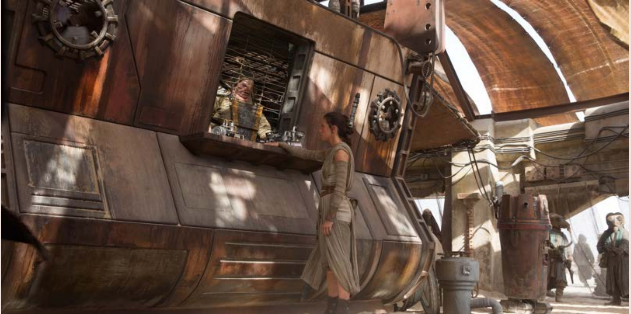
The Force Awakens, Star Wars Episode V11. Disney