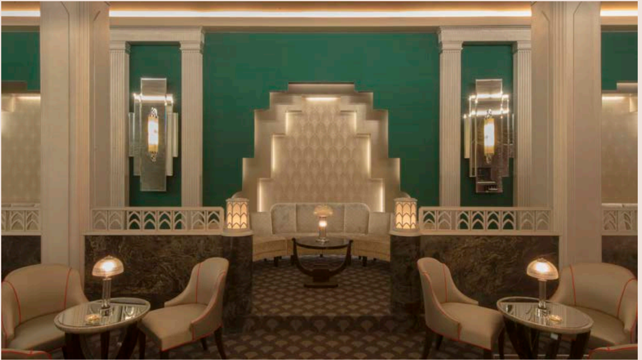
The Haleyon, Left Bank Pictures