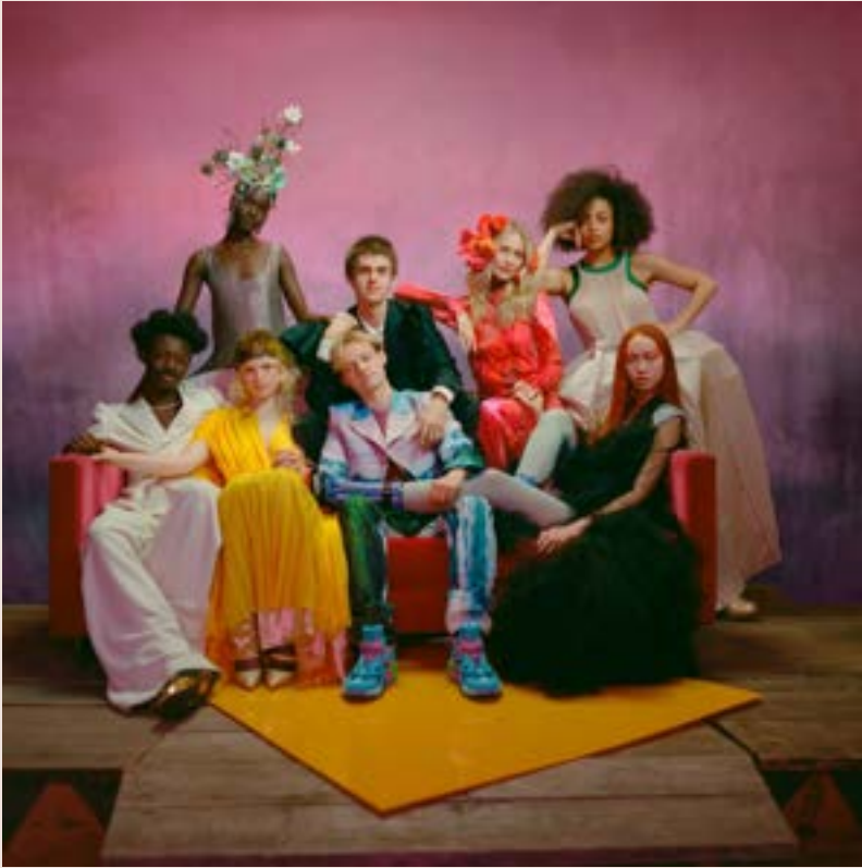
“Come As You Are” for Vogue Global May 2022