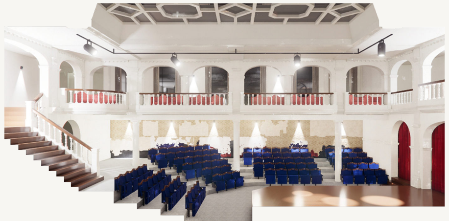
Design project: Reminiscence Elevation Render on Rhino