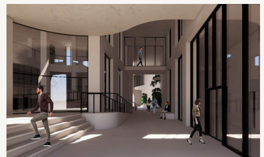
Design project: Connected 3D Render on Rhino