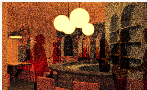
Design project: The Local Bar 3D Render on Rhino