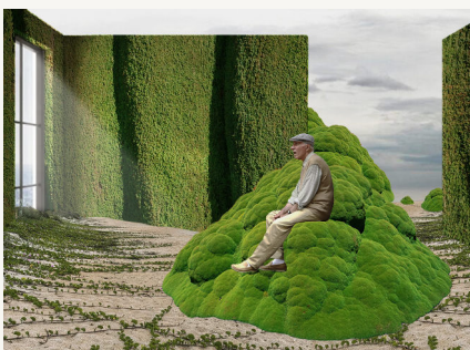
Design project: Abandoned Beauty Adobe Photoshop Collage