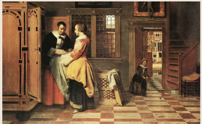
Public and Private Modernities / top / Gerard ter Borch, The Stone Grinder's Family , 1653-55 Gemaldegalerie, Berlin bottom / Pieter de Hooch, Interior with two women at a Linen Closet , 1663, Amsterdam