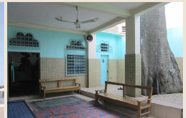
Postcolonial Cultural Geographies left / Dakar International Fairgrounds, Dakar, Senegal right / Entrance to the mosque at El Hadj Gueye and kapok tree (right), Dakar, Senegal